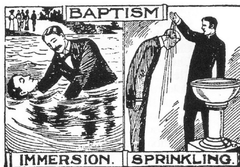
Which Is Baptism?

“WHOSOEVER KEEPETH THE WHOLE LAW, YET OFFENDS IN ONE POINT IS GUILTY OR AIL.”